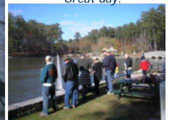
Cool, testing boats and pine straw. Great day.