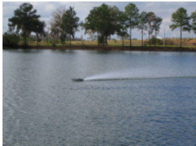
AU boat at 54.5 mph, SAW Event in Valdosta