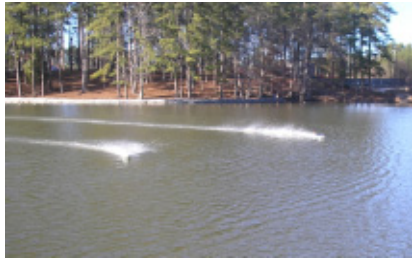
Titan and Whooped running together for the first time