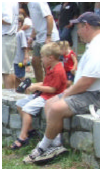
Fun time Lakeside