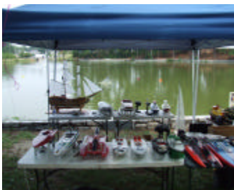
Lots of boats