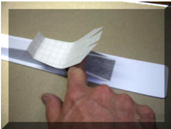
As you peel the paper rearward, slide your finger rearward, firmly along the decal. This will avoid trapping air bubbles under the vinyl.