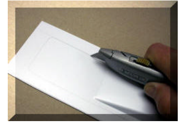
Use a box cutter or hobby knife with a new blade to score the pencil mark. Make one light pass concentrating on following the line, then follow with a second pass.