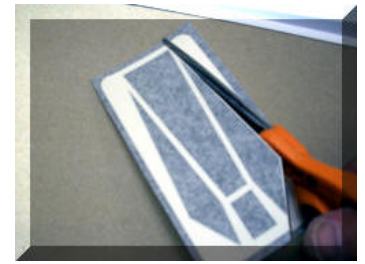
Cut the decal close to the edge of the black vinyl.