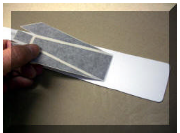
Align the windshield to the base of the cowl where the slope begins. Touch the front edge to adhere it to the cowl.