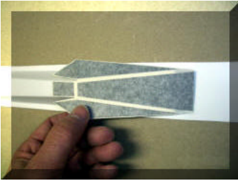
Check the alignment of the decal by laying it back on the roof. If it is not aligned, peel it off and start again.