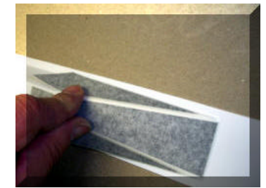
Fold down the side windows by running your finger along the crease back & forth moving downward, until the side window is adhered to the cowl.