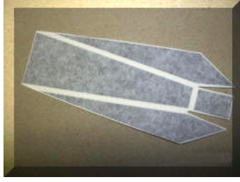
Cut two notches in the white area between the roof and the side windows.