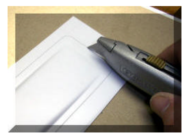
You are not cutting through the plastic. You just want to cut the surface. If you are uncomfortable with razors, then use a pair of sharp scissors to cut out the cowl