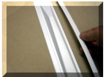
Once the piece has separated, repeat for the other three sides.