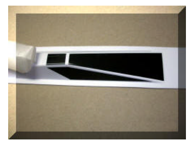
From the front, peel the application tape off of the decal. Peel slowly, making sure that you are not lifting off the decal at the same time.

When it is aligned, press across the front and begin to peel the backing paper off.